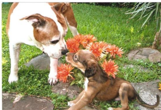
2 month old Saluki pup and BusyBoy who is 11 years old!